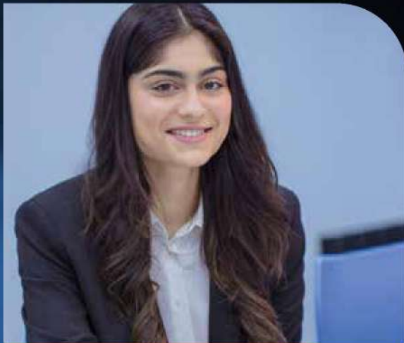
Theory in Classrooms