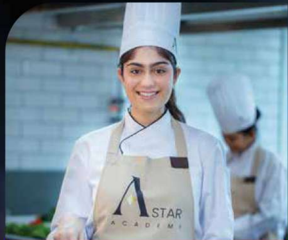
Practicals at Hotel Sahara Star